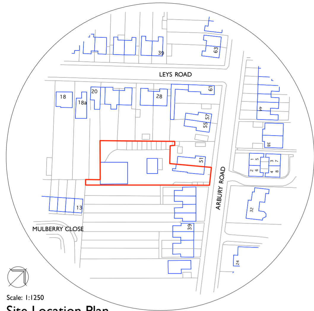
Scale: 1:1250 Site Location Plan